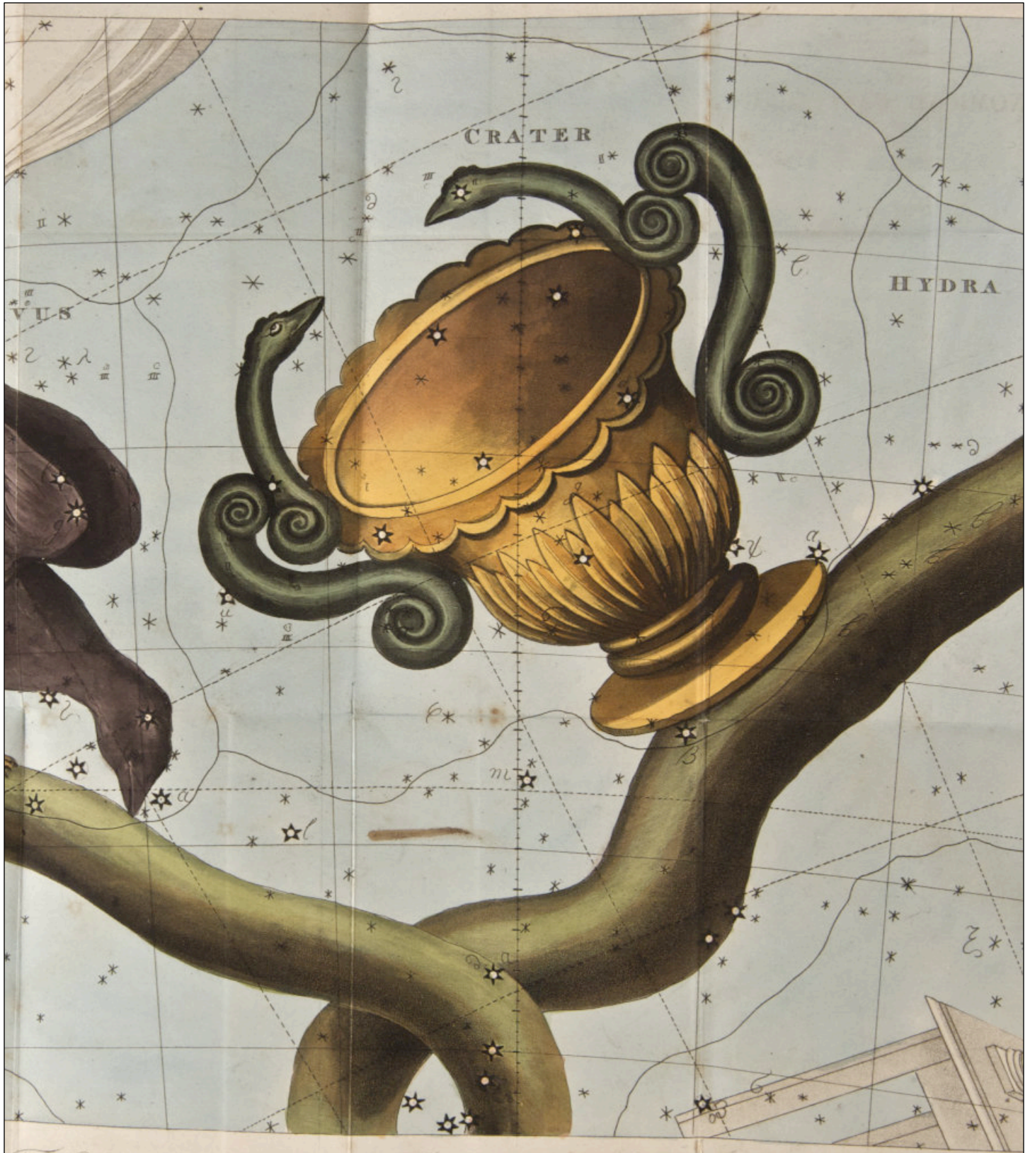
Catherine Whitwell, An Astronomical Catechism (London, 1818)

Exhibit: Galileo's World | Gallery: The Sky at Night | No.: 19