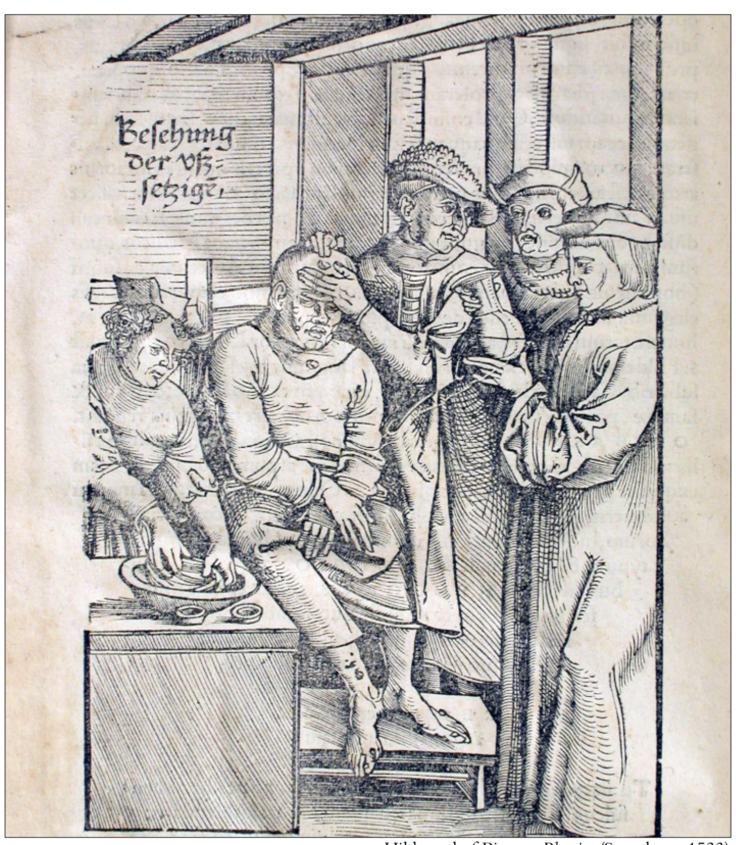
Hildegard of Bingen, Physica (Strassburg, 1533)

Exhibit: Galileo's World | Gallery: Music of the Spheres, no. 19 Download learning leaflets at lynx-open-ed.org; read more in the Exhibit Guide (IBook Store).