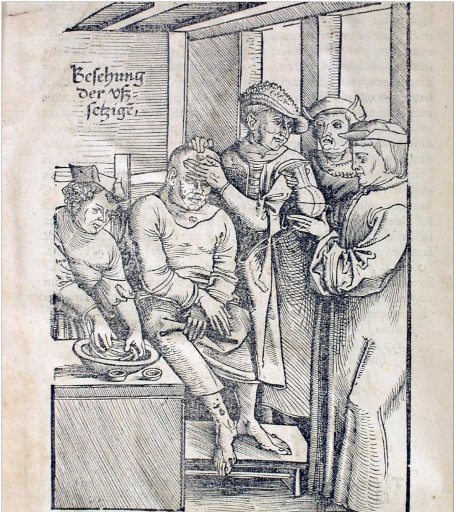
Hildegard of Bingen, Physica (Strassburg, 1158)

Exhibit: Galileo's World | Gallery: Music of the Spheres, no. 19