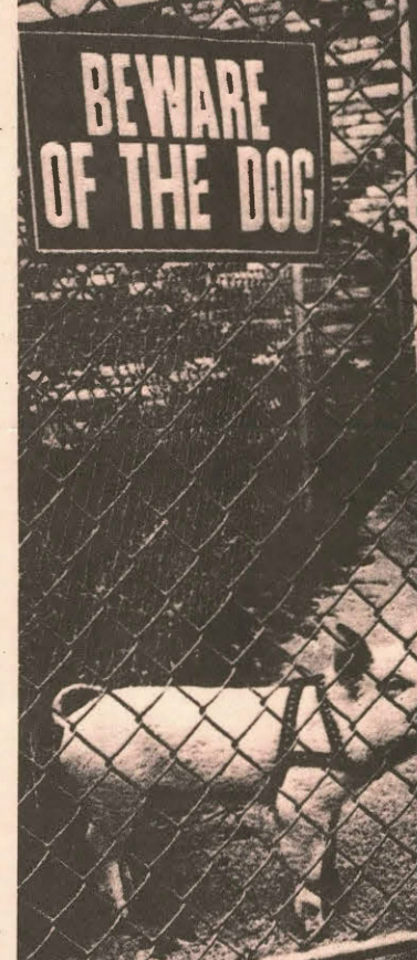
WATCHPIG — A news photographer spotted this unusual breed of canine in the front yard of a Hampton, Va., home recently. The sign may seem misleading, but there's probably a short supply of "beware of the hog" signs.

Democrats; 970 Republicans and 46 Independents. Glencoe lists 304 Democrats, 138 Resublicans and one Independent adding up to 441; Perkins (city and township) lists 520 Democrats, 283 Republicans and one Independent, totaling 849; Ripley has 262 registered as Democrats, 126 Republicans and six Independents. Yale has two precincts totaling 847 registered voters. Their records show 559 Democrats, 179 Republicans and nine Independents.