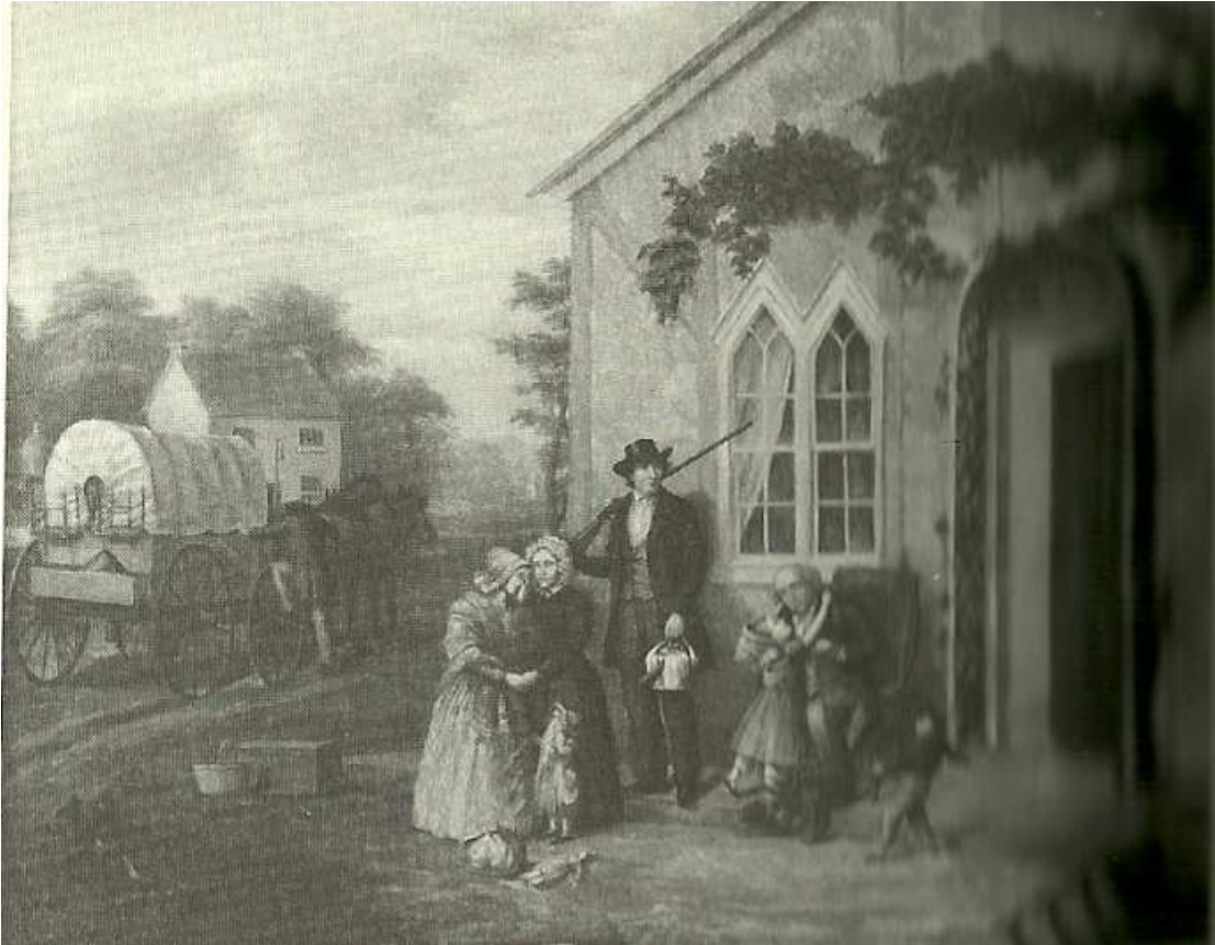
Figure 7: Leaving the Old Homestead (1853)

(Source: Janet Floyd, Writing the Pioneer Woman , 72)