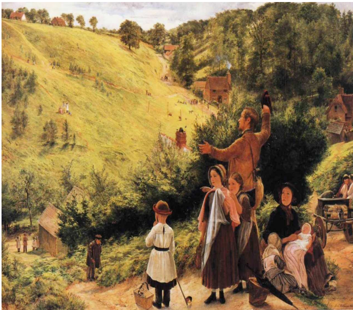
Figure 6: The Emigrant's Last Sight of Home (1855)

Other paintings that present women as sad to move West were Richard Redgrave's, The Emigrant's Last Sight of Home (1855) and James F. Wilkins', Leaving the Old Homestead (1853). 5