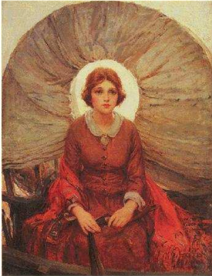
Figure 5: Madonna of the Prairie (1921)

and also from W. H. D. Koerner Madonna of the Prairie (1921).