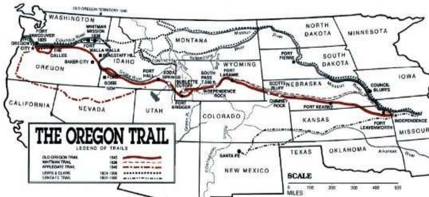
Map 1. Oregon-California Trail - The Oregon Trail