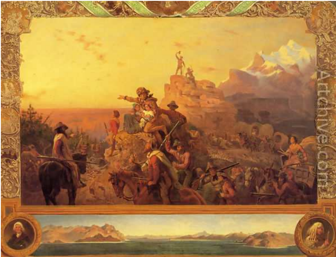
Figure 4: Westward the Course of Empire Takes Its Way (1864)

(Source: Goetzmann and Goetzmann, The West of the Imagination , 116.)