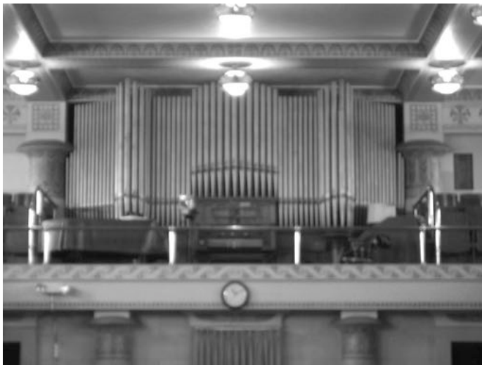
8.1 Lakewood Organ