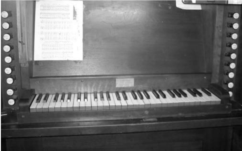
5.2 Zoar Keydesk

measurements are almost identical to the Zion organ, indicating a company standard was in use at the time.