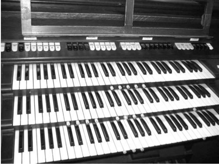
9.2 Notre Dame Manual