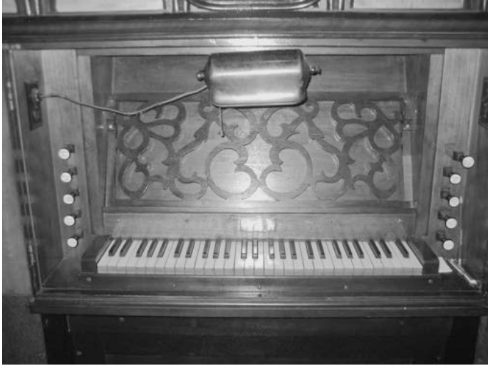
4.2 Zion Keydesk