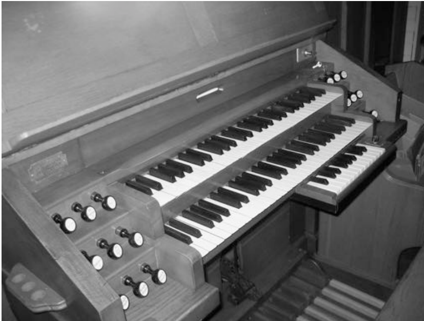
6.2 Rootstown Keydesk

the pedals without playing them. This is the only instance of such a device in all of the organs examined. The calcant signal now operates the tremolo.