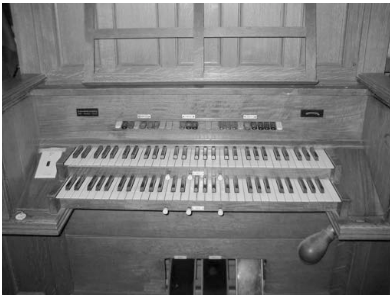
8.2 Lakewood Keydesk

furnishings that also adorn the lower portion of the organ case (fig. 8.1). The facade consists of two rounded towers on either side, a rounded section in the middle, and straight connecting sections in between. Facade pipes are dummies except for those in the towers and outer edges. The two-manual sixty-one note keydesk is attached to the case, with color-coded stop tabs for flutes (dark brown), strings (light brown/blond) reeds (pink), and couplers (black for intermanual and white for intramanual) (fig. 8.2). This color-coding is rare on Holtkamp instruments, one other known example being the 1919 organ in Kensington Methodist Church in Buffalo, New York. Pistons provide combination action for the organ in the form of three divisionals each for the Great and Swell: 1, 2, and 0 (cancel). The pedalboard has a compass of thirty notes, and is concave but not radiating. The Great and Swell divisions are both enclosed, and an expression shoe is provided for each, as well as a crescendo shoe. The Lakewood organ uses a plain rectangle design for its expression shoes unlike the stylized shoe shape found on previous organs (fig. 8.3).