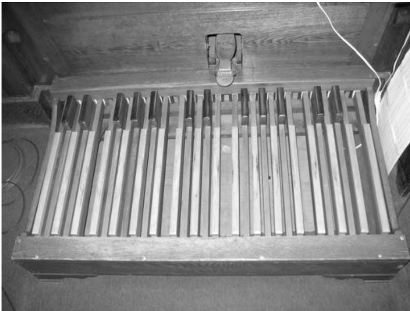
7.2 St. Adalbert Pedalboard

Stop knobs are arranged horizontally and terraced on three levels located on either side of the keydesk (fig. 7.1). Stop names are indicated by machine engraving and are arranged with the right side consisting of the Great 8' ranks on the top level, 4' on the middle level, and all the couplers on the bottom level. The left side contains the Swell 8' ranks on the upper level, 4' rank on the