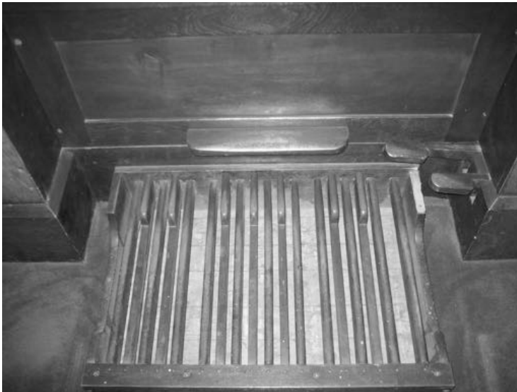
4.3 Zion Pedalboard

The stop knobs on either side of the keydesk are labeled with a cursive script indicating the name and pitch level of their respective ranks. In addition, there is a knob for coupling the bass to the pedal and a knob marked “signal,” originally used to let the calcant (the person who manually operated the bellows to provide wind for the organ) know when to start operating the bellows. The signal knob currently operates the tremolo.