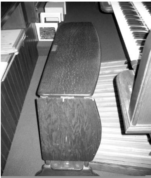
9.5 Dropleaf Bench Down