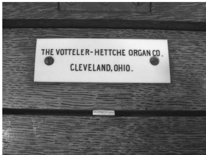
St. Adalbert Church