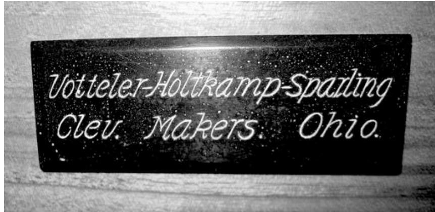
Lakewood Masonic Temple