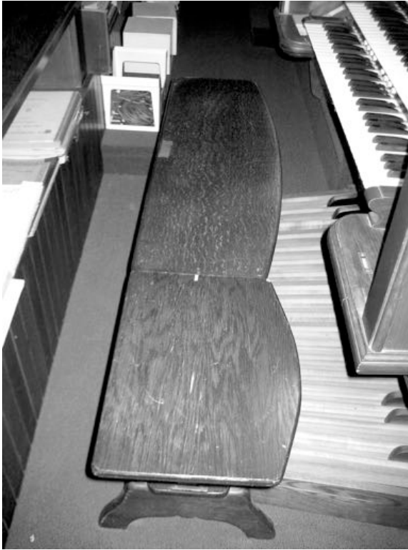
9.4 Dropleaf Bench Up

three pipes instead of sixty-one, allowing octave coupling to cover the entire keyboard. The current organ bench, featuring a drop leaf on the right side for an assistant, was donated in 1939 (fig. 9.4 and fig. 9.5).