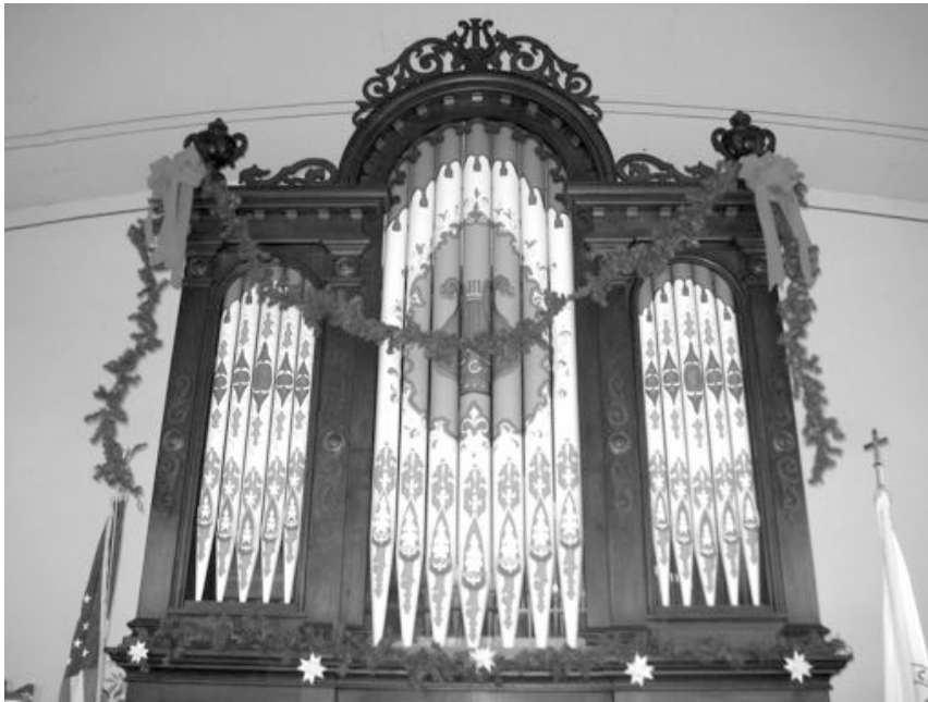
5.1 Zoar Case

swell shoe located on the right hand side and two levers (one combination and one cancel) in the center (fig. 5.3). The original pump handle is located on the right hand side of the case. Since the organ currently utilizes an electric blower the handle is no longer used.