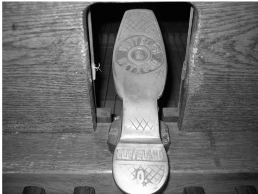
St. Adalbert Church