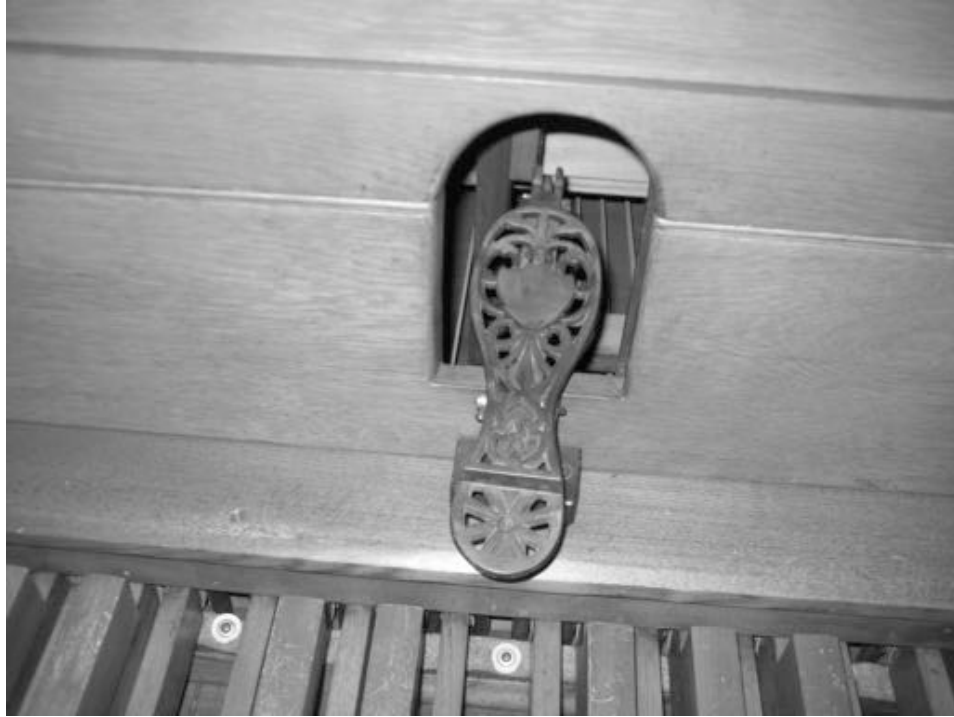
First Congregational Church Rootstown