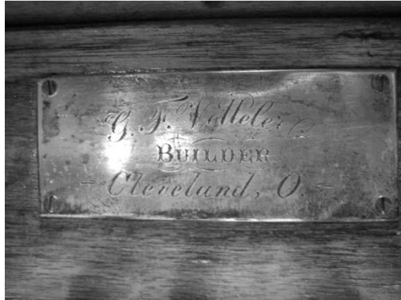
Zoar United Church of Christ