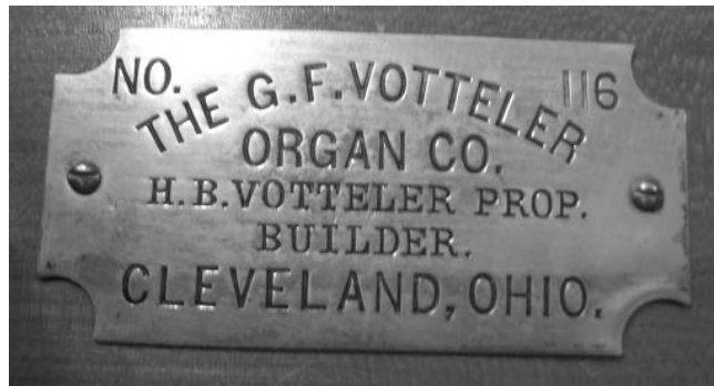
First Congregational Church Rootstown