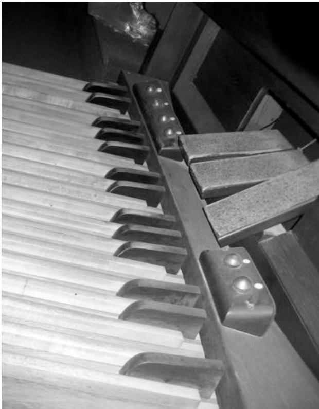
9.3 Notre Dame Pedalboard