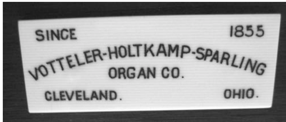
Notre Dame College