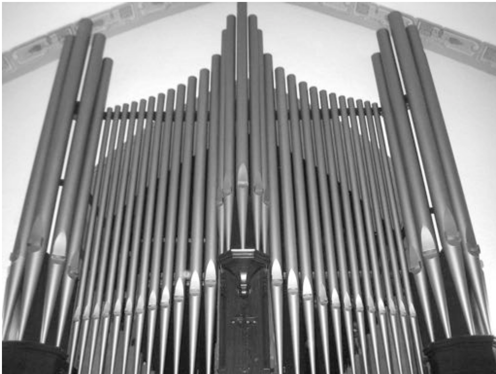
9.1 Notre Dame Facade