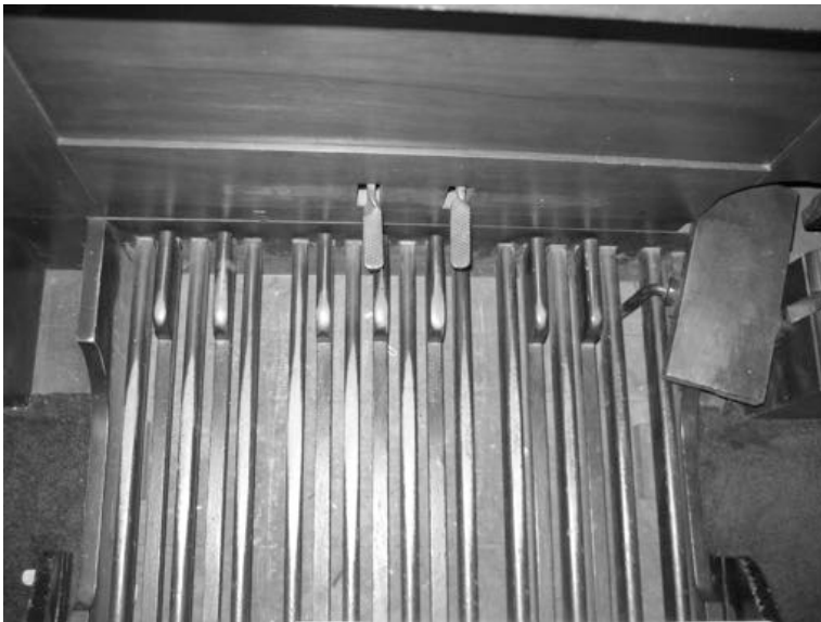
5.3. Zoar Pedalboard

The sound of the organ overall is both clean and pleasant. Chiff is almost completely absent through all the ranks, which adds to the gentle tone. In almost every rank, a subtle and smooth decrescendo can be observed from the bottom to the top of the register. All of the pipework is original to the organ, and this particular instrument offers an authentic look into the sound aesthetics of the time when it was built. All of the pipes are enclosed except for the 8'