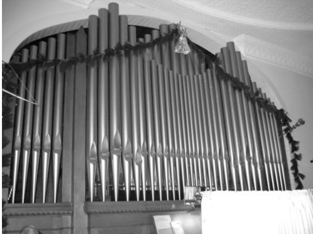
6.1 Rootstown Facade

The organ currently stands at the center front of the sanctuary. It is set inside an arched chamber, with only the facade principal pipes exposed (fig. 6.1). The case has almost no decorations of any kind with the exception of a carved pattern directly below the pipes that extends across the front. The two manual keydesk is attached to the case, with three tiers of draw knobs on either side of the keyboards and an added chime keyboard below the Great manual (fig. 6.2). The Great stop knobs are located on the right hand side of the keydesk and arranged by pitch level ascending from the top tier down. The Swell stop knobs are organized differently, with the 2' and 4' ranks located on top tier (along with the 8' Stopped Diapason) and the other 8' ranks on the second tier. The pedalboard is flat and straight, with a shoe-shaped swell shoe (fig. 6.3). The Great and Swell manuals have fifty-eight keys each, the pedal has twenty-seven keys, and the chime keyboard has twenty-one keys. The stop and key action are both mechanical. Stop names are written in script, with ranks in black and couplers in red. A curiosity is the "pedal check" knob, which prevents the pedals from being depressed thus allowing the organist to stand on