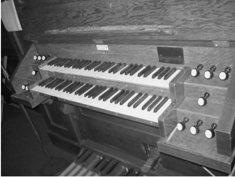
7.1 St. Adalbert Keydesk