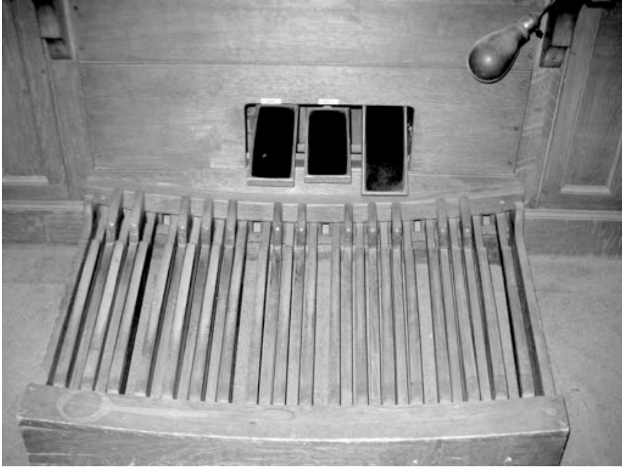
8.3 Lakewood Pedalboard. The concave design is a marked change from previous instruments

An item of particular interest is the tubular-pneumatic action, which is kept in working condition and the organ is used regularly. This type of action was short lived and is relatively rare to be found in operational organs anymore. Sluggish response, time lags between divisions, and limitations on console placement led to many tubular-pneumatic actions being replaced with electro-pneumatic or all-electric action. The company was using mechanical action as late as 1906 (Crow River Lutheran Church, Belgrade Minnesota), and switched to tubular-pneumatic at least by 1910 (Trinity Lutheran Church, Vermillion, South Dakota). The use of tubular-pneumatic action was short lived, however, and by 1919 organs were being built with electro-pneumatic chests (Kensington Methodist Church, Buffalo, New York). The size of the Lakewood organ (thirteen ranks) and the attached keydesk create a situation where tubular-pneumatic action can function quite well, as evidenced by its continued use.