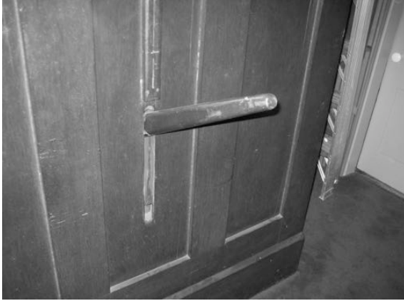
4.1 Zion Hand Pump

The stop and key action are mechanical, with wind provided by the aforementioned electric blower. The case is relatively plain, with three groupings of facade pipes symmetrically arranged (collectively and individually) with the taller pipes in the middle and shorter ones on either side. Beneath the pipes, running the length of the case, is a decorative pattern. The keydesk (fig. 4.2) consists of a fifty-six key manual keyboard with stop knobs in vertical lines on either side. The music rack is fixed in position and carved with an open filigree pattern. Keys are made of ivory in block piano style with no overhang. A music light plugs into an outlet on the left side of the keydesk, and a switch to operate the blower is located on the upper right side of the keydesk. Doors on either side can swing closed and lock to provide security as needed.