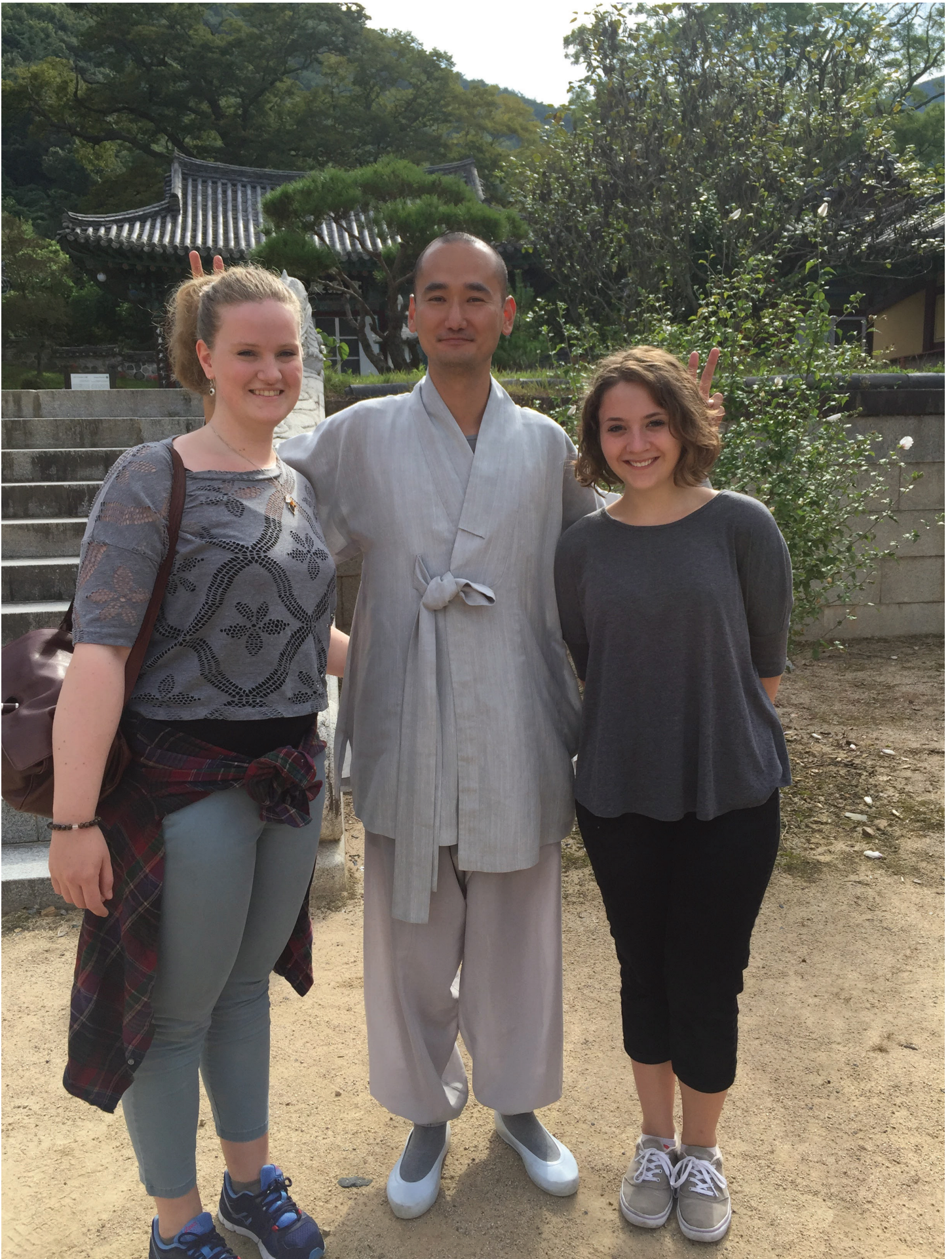
My friend (left) and I (right), taking a picture with a Confucian monk in a rare temple complex that was half old traditions and half new.