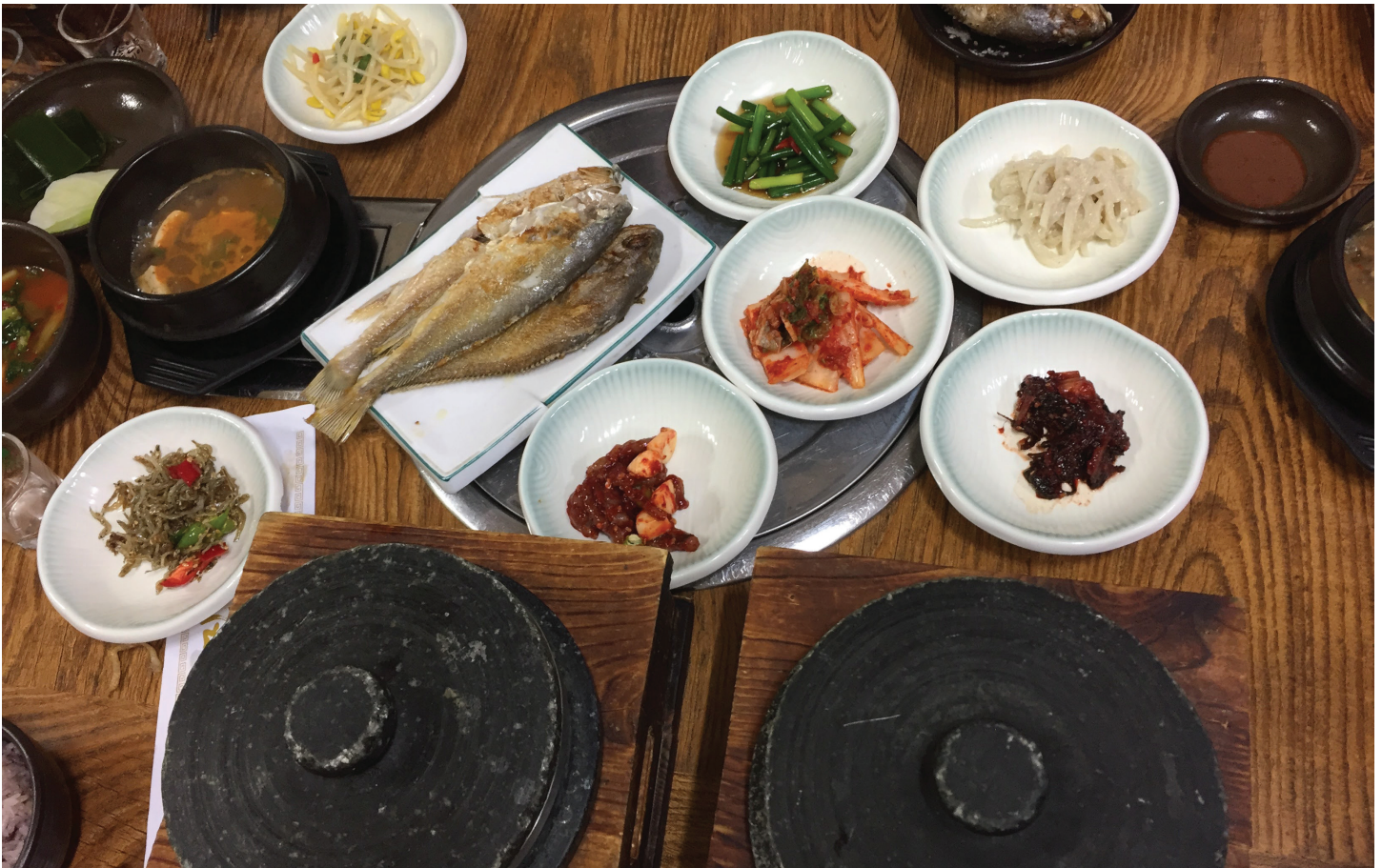
A very traditional meal including soup in stone bowls that is served still boiling, kimchi (a fermented cabbage side dish), pickled sprouts, gently fried whole fish, fermented black beans, a spicy peanut-based spread and chopped greens.