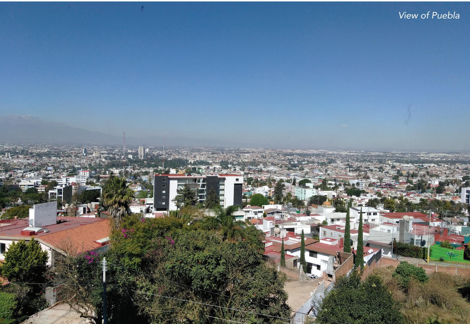
View of Puebla

Without an open mind, I do not believe I would have learned about and appreciated much of the culture and identity that makes up Mexico. Because I did, I feel that I was able to understand and appreciate the beauty and complexity that is Mexican culture. Open-mindedness can be difficult when studying abroad, but if I had to use my time in Puebla, Mexico, as an example, I would say it is important to have one at all times—the results can change your appreciation of a society and culture, and maybe even change your entire worldview.