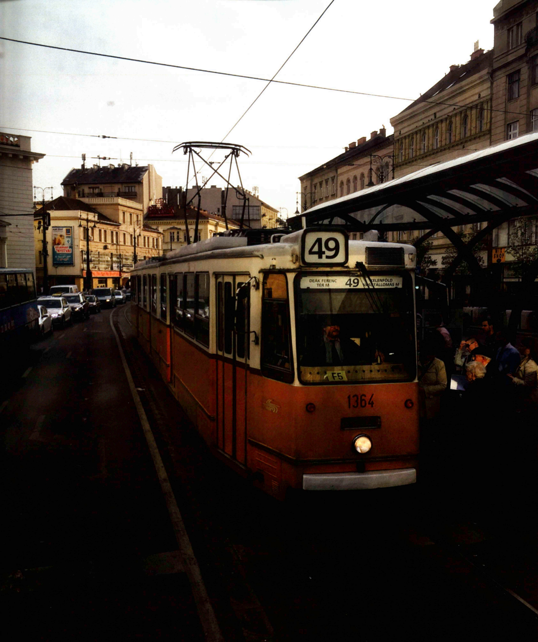
ANYONE FOR THE TROLLEY? BUDAPEST, HUNGARY