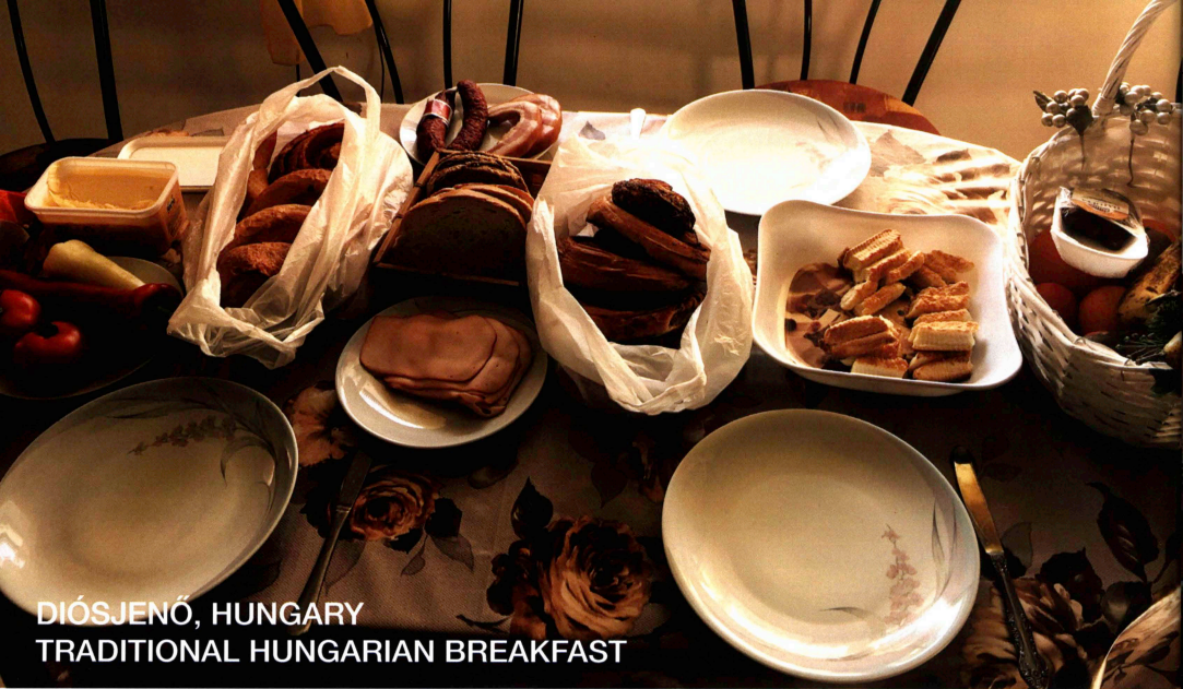
DIÓSJENŐ, HUNGARY TRADITIONAL HUNGARIAN BREAKFAST