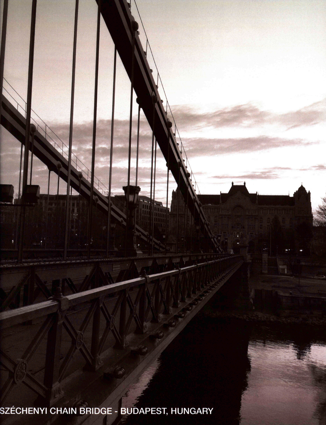
SZÉCHENYI CHAIN BRIDGE - BUDAPEST, HUNGARY