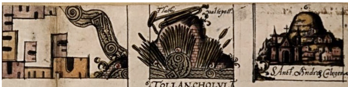
Figure 3. Inset image of the Cholula Map highlights the upper-right portion of the larger map of Cholula.

The next spatial example of layering in the Cholula map is the illustration of the hill and native imagery in the upper right hand section of the map (Fig. 3). This image is made up primarily of indigenous symbolism with only a hint of a man-made structure and symbol displayed by the brick structure and trumpet above the hill. The section also has the local Nahuatl name for the city inscribed below it. 27 Indigenous water imagery almost completely engulfs the structure and highlights the presence of the mountain rising above it. Although these symbols are purely native, they are drawn almost entirely within a grid square, again suggesting the hybrid lens that local peoples are view their new environment through. The grid format of cities by this time has shaped local views so extensively that even pictures and symbols, well established before the formation of the town, are still observed as existing within the Spanish colonial framework.