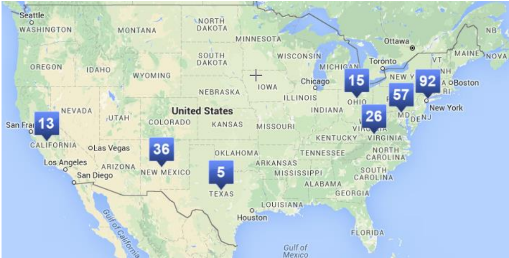
Figure 4. National distribution of SEMAA participant questionnaire respondents