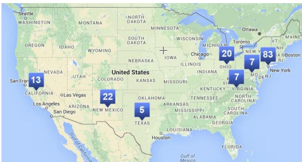
Figure 3. National distribution of parent questionnaire respondents

Parents’ locations. Figure 3 depicts the national distribution of the parent questionnaire respondents. Locations represent the state where their child participated in the SEMAA.