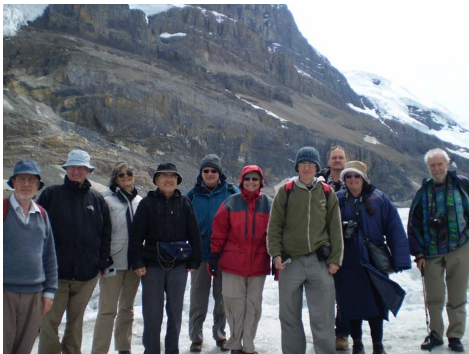
INHIGEO group visiting the Columbia Glacier

At Bow Summit a view over Peyto Lake and the linear Mistaya Valley graphically demonstrated the influence of thrusting and glacial erosion in the formation of the Rocky Mountains. After admiring several beautiful lakes, including Bow, Hector and finally Louise, the overnight stop was at the town of Lake Louise. In the evening the field trip dinner was in a restaurant tastefully converted from a genuine CPR station. To add to the ambience of the surroundings there were the passing rumbling lines of wagons as long trains made their way to and from Kicking Horse Pass.