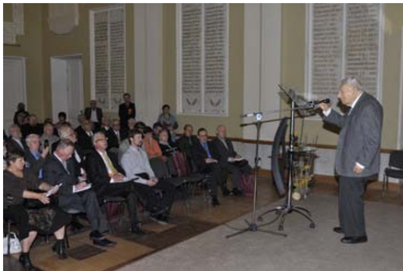
The late Victor E. Khain speaking at the International Conference 'Modern Geology: history, theory, practice' on the 250 th anniversary of the Vernadsky State Geological Museum held in Moscow, October 2009)