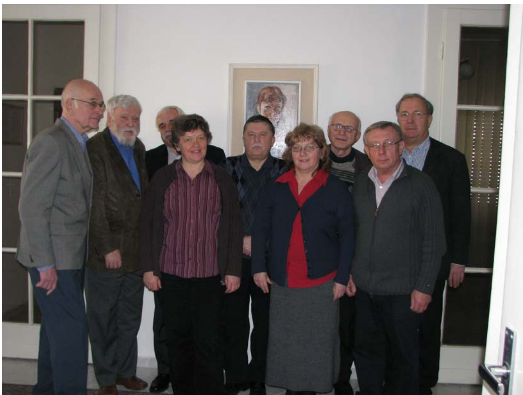
VISEGRAD Project members at their first official meeting in Bratislava, Slovakia