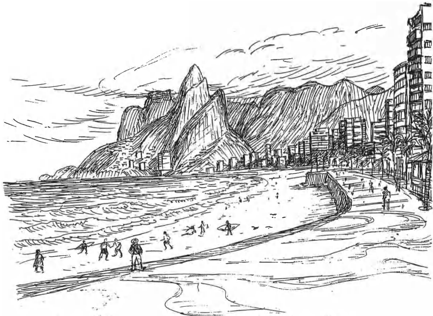
10.8. 1955 11.11.1955 View of Rio de Janeiro Beach of Espinosa - Two Brothers mountain on the background Rio de Janeiro, 10.8.2000