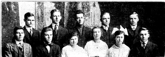
SCHOLARSHIP WINNERS, OKLAHOMA A. & M. COLLEGE, YEAR 1916-1917 —o—