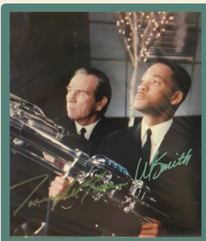
Autographed Men in Black photo

Advertisements Autographs Celebrities Collages Correspondence Film stills Film transparencies Lobby cards Motion picture posters Publicity photographs Television scripts Television stills