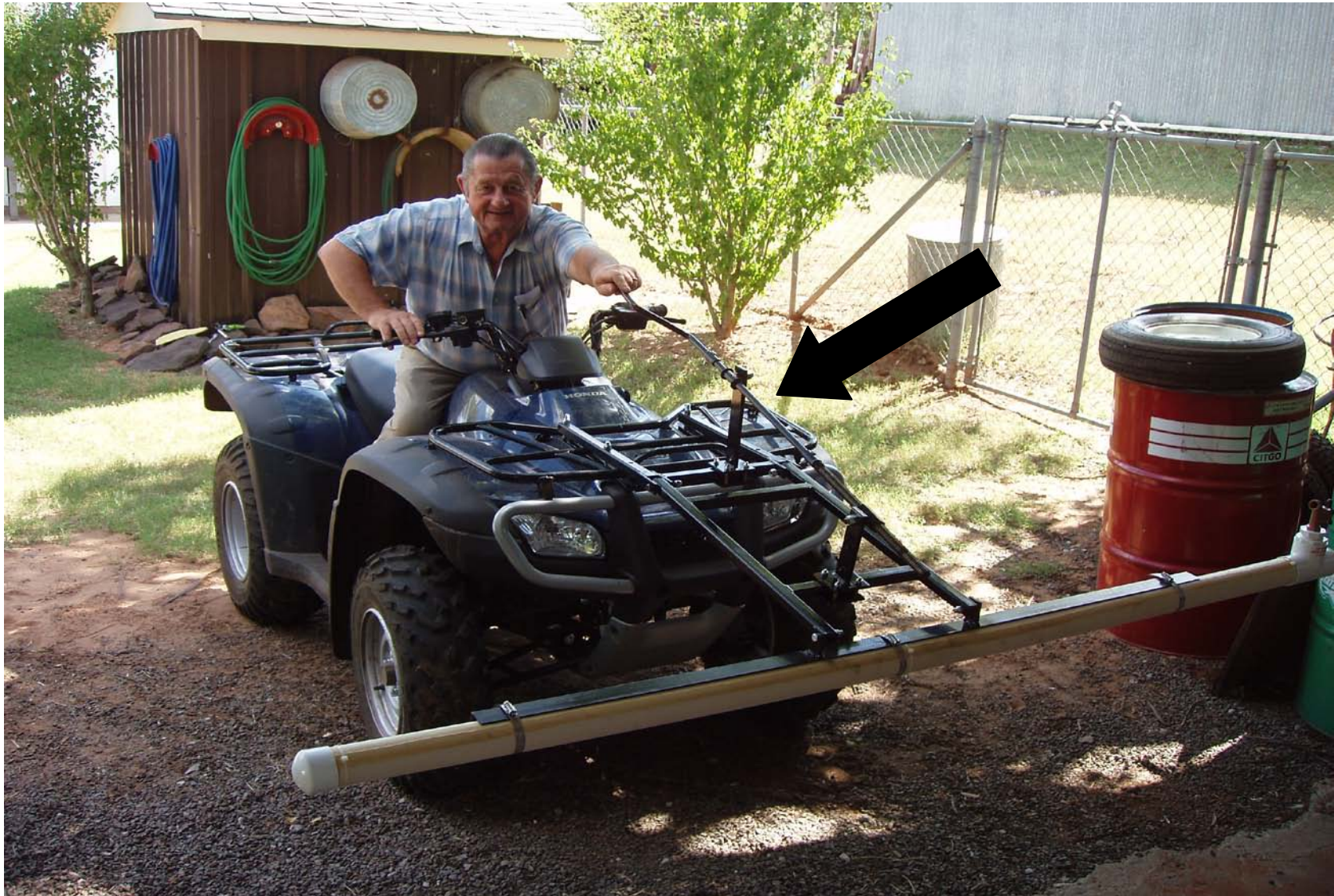
Figure 1. Image of ACR Sales ATV/Utility Vehicle Bracket Mounted to Honda 4-Wheeler.