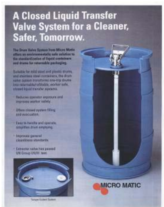
Figure 3. Micro Matic cut away showing drop tube extraction system.