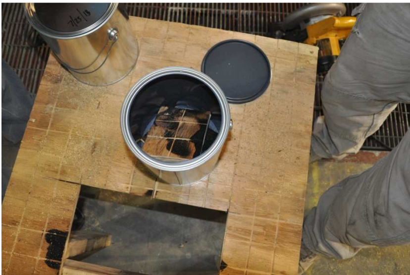
Figure 4. Burned wooden table sample collection. The photo depicts the area of the small wooden table that was sawed off and collected for analysis.