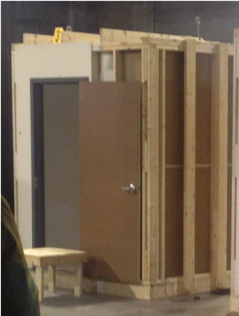
Figure 1. Residential hut. Each hut was made of wood and contained drywall, carpet, etc. which are commonly found in residences. Small wooden tables, as seen in the bottom left, were also used to represent furniture.

carpet, padding, empty Gatorade bottles, blowtorch, cameras, and evidence collection supplies. FRL research staff built small “huts” to mimic actual residential compartments. An important aspect of each hut was that it contained a wooden structure, drywall, and carpet with pad. These materials are commonly found in homes and apartments. Additionally, small wooden tables were built and placed in each of the four huts to demonstrate residential furniture. See Figure 1 for a photo of the residential hut.