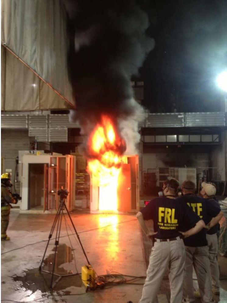
Figure 2. Residential hut on fire. After each One-pot Gatorade bottle was ignited, the fire would start out slow, but then evolve into large flames that you see in this photo.

After each hut was deemed safe and absent of any fire or smoke, the interiors were photographed and documented as if actual arson crime scenes. ATF agents then proceeded to collect and package several types of evidence. Samples included solid product from the Gatorade bottle, wood from the table, carpet and pad section that likely contained spilt solvent, and wall wipes. See Figures 3, 4, and 5 for photographs of solid product, wood, and carpet samples respectively. For the solid product, forceps or tweezers were used to scoop waste or “sludge” from the Gatorade bottle. For wood samples from each table, a burnt section was cut with a saw. For carpet and pad, a box cutter was used to cut a section. For a wall wipe, a piece of gauze was