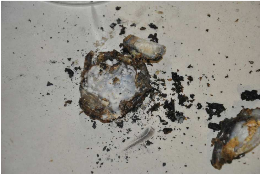
Figure 3. Burned solid methamphetamine waste sample collection. The photo depicts the remnants of the One-pot Gatorade bottle post-fire. The white substance is solid methamphetamine waste or "sludge."

dipped in sterile water and wiped up and down the walls of each residential hut. Every sample, [see Table 1 for a complete list], was appropriately labeled and packaged in a clean, empty paint can.