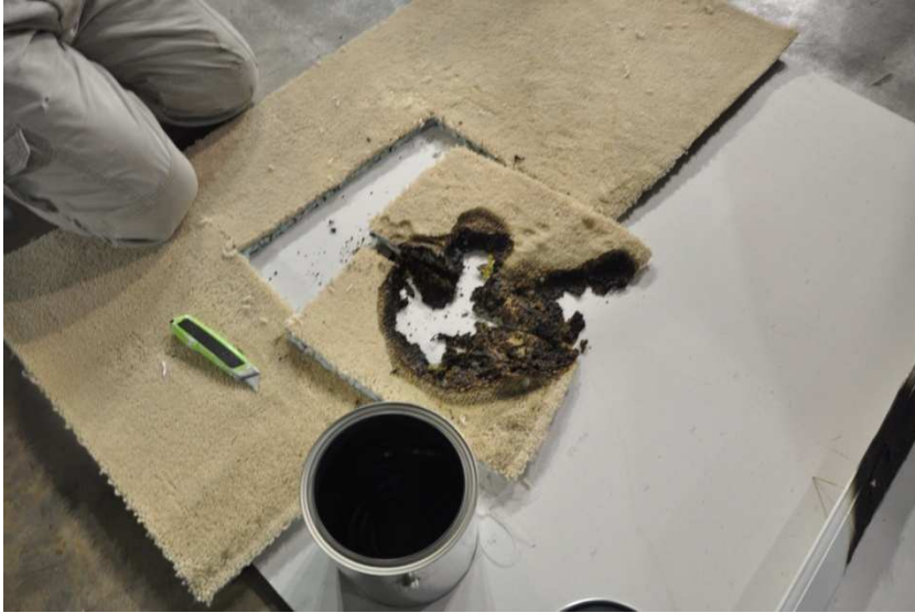
Figure 5. Burned carpet sample collection. The photo depicts the area of the carpet that was cut and collected for analysis.